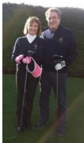
Two relieved captains - the crowd did not put them off!