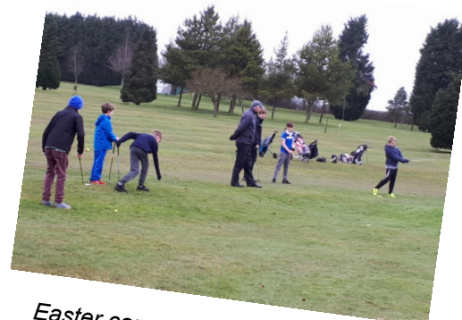
Easter camp on the Practice ground.

On Saturday we had 9 juniors attending our regular weekend coaching session and the signs are looking good for greater junior participation at the Club. Along with the sessions at the Club, I have also delivered coaching sessions at Bottesford and Frisby Primary Schools. These sessions are run in conjunction with the Leicestershire Sports Partnership and all the children have enjoyed their sessions, many experiencing golf for the first time.