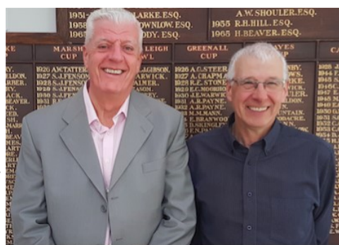
Humberstone Heights and Melton Seniors' captains

A full report is available on the website or click here .