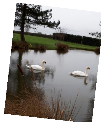
At least the swans are enjoying the water!

If we all do our bit, it will make a huge difference to the enjoyment of members and guests alike.