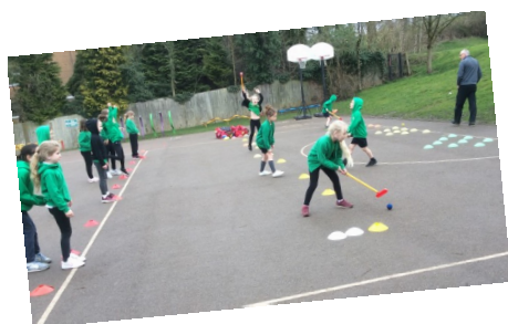
Fun at Frisby Primary School

The first #DiscoverGolf Junior Easter Camp was held last week at the club. In all, we had 7 junior golfers attending the three sessions on Tuesday, Wednesday and Thursday. We covered all areas of the game from putting through to the long game. The ages ranged from 9 to 15 years and all enjoyed the sessions. The idea behind each session was to help them explore their golf and discover what is possible for them.