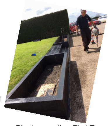
Planters on the First Tee a topic of conversation for 'Down to Earth' radio.

There were a good number of members and visitors in attendance and a number of varied questions were posed. It was a very entertaining and well organised evening with lots of useful information and tips for gardeners covering everything from weed control, dying shrubs and insect problems to winter digging of vegetable plots. There was also some useful guidance into what could be planted in our newly built planters at the first tee.